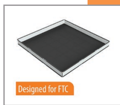
Optional Perimeter $659