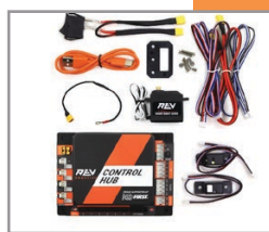
Electronics Set $315