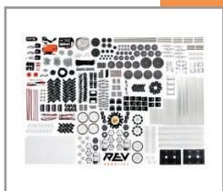
REV $640 Build Instructions