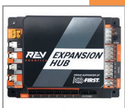
REV Expansion Hub $250

If your team will be using more than 4 motors, you will need a REV Expansion Hub