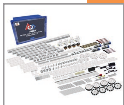
Tetrix $630 Build Instructions