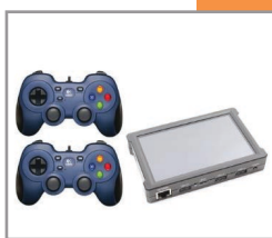
Control & Communications $275