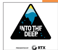
Optional Game Set $390 (partial) or $460 (full)