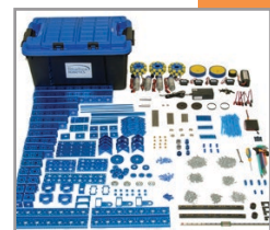
Studica FTC Starter Kit $585 Build Instructions

If your team will be using more than 4 motors, you will need a REV Expansion Hub