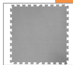
Optional Tile Set $259